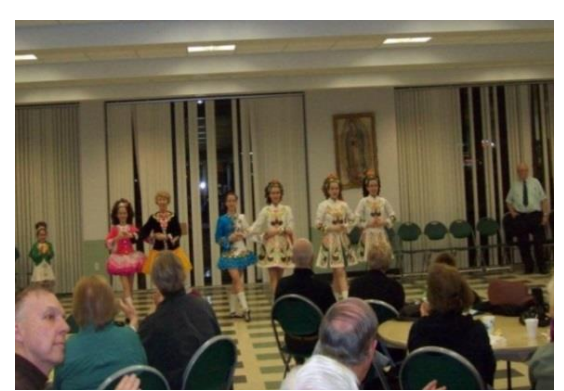
O Neil School Dancers