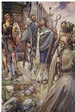
Saint Columcille, Apostle to the Picts

But who was St Columcille after whom this prestigious award is named?