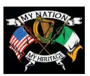
Halfway to St Patrick Day Celebration

The Heritage Committee is gearing up for the 5<sup>th</sup> Annual Halfway to St Patrick Day Celebration which will be held on September 10<sup>th</sup> at Lake of the Woods. 130 tickets are on order and will be available prior to the June meeting. $35/person includes choice of salmon or corned beef dinner, commemorative pint glass, live Irish Music and Irish dancers, plus ceili dance lessons (a popular form of folk dancing in Ireland).