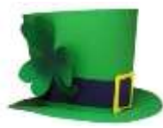
General Meagher Division Attire

In a perfect world every brother would have these articles of clothing: