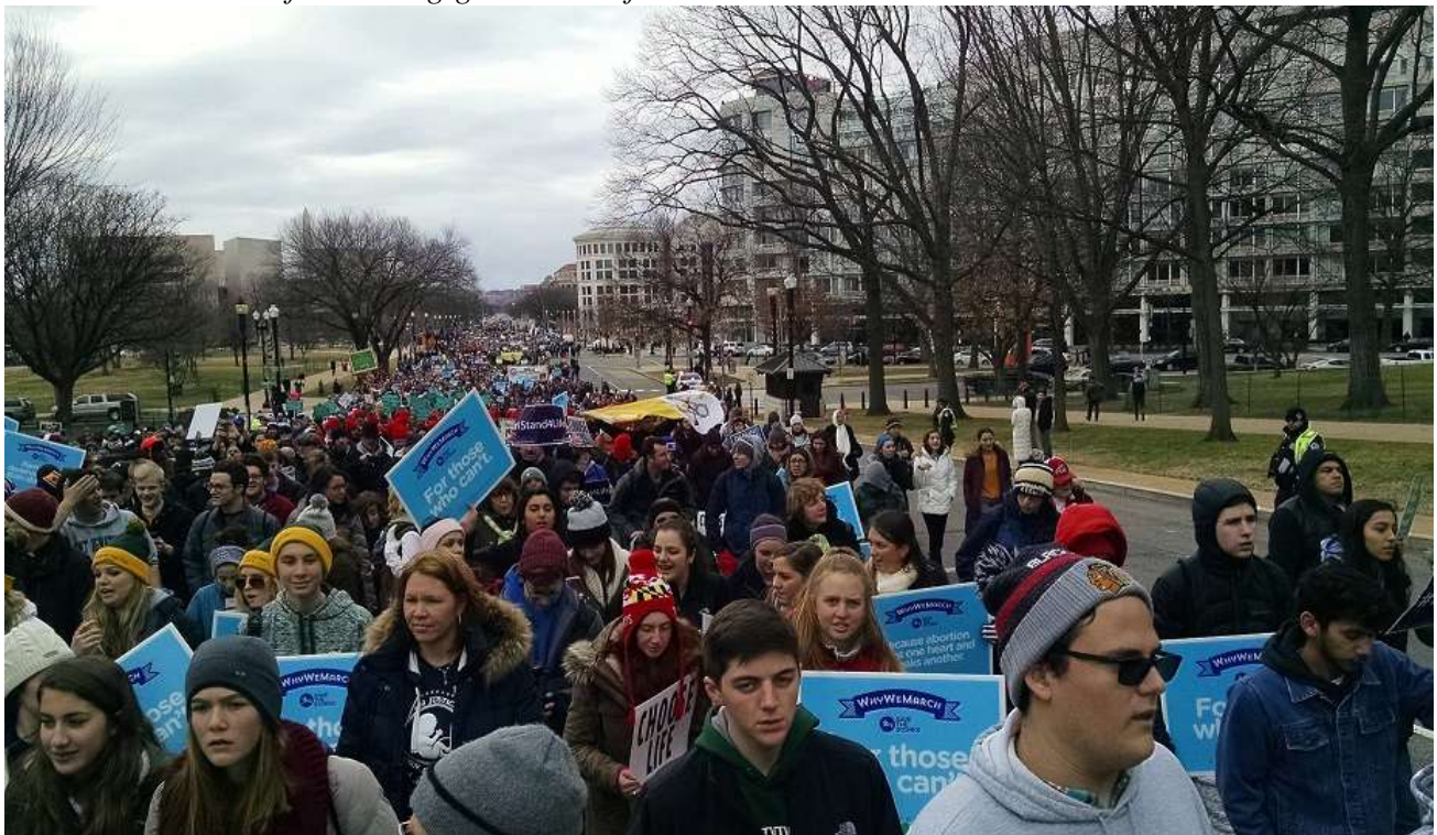
Pro-Life Marchers filled Constitution Avenue!