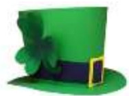
General Meagher Division Attire

August 16-18: Biennial State Convention at the Leesburg Hotel & Conference Center 726 East Market Street, Leesburg, Virginia. Register now at: https://aohvirginia.org/2019/02/21/aoh-va-state-convention-2019/