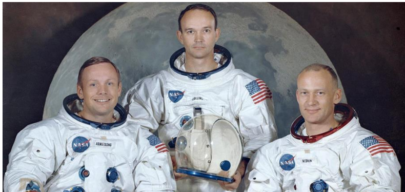
The Apollo 11 crew. From left: Neil Armstrong, Michael Collins, and Buzz Aldrin.