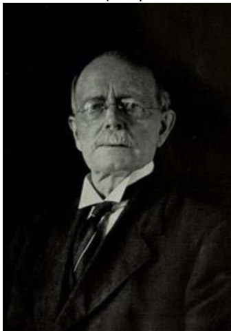
John Phillip Holland