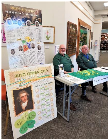
The 2022 IAHM display