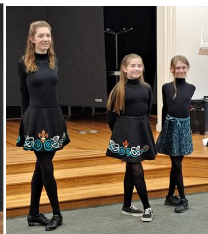
and at Salem Church