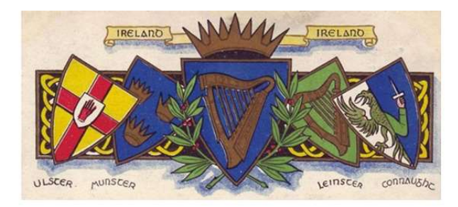
The Celt would forfeit his title to the respect of the civilized world, did he not fight with all his heart and all his soul and all his cunning against the empire which has despoiled him and murdered his kin, now with arms, now with artificial famine. There can be no peace between the two people until either Ireland is a desert or is free. There can be neither truce nor compromise.