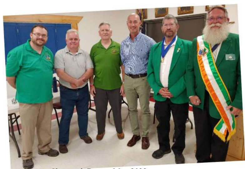
Shamrock Degree May 2022