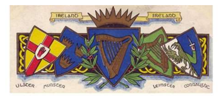
The Celt would forfeit his title to the respect of the civilized world, did he not fight with all his heart and all his soul and all his cunning against the empire which has despoiled him and murdered his kin, now with arms, now with artificial famine. There can be no peace between the two people until either Ireland is a desert or is free. There can be neither truce nor compromise.